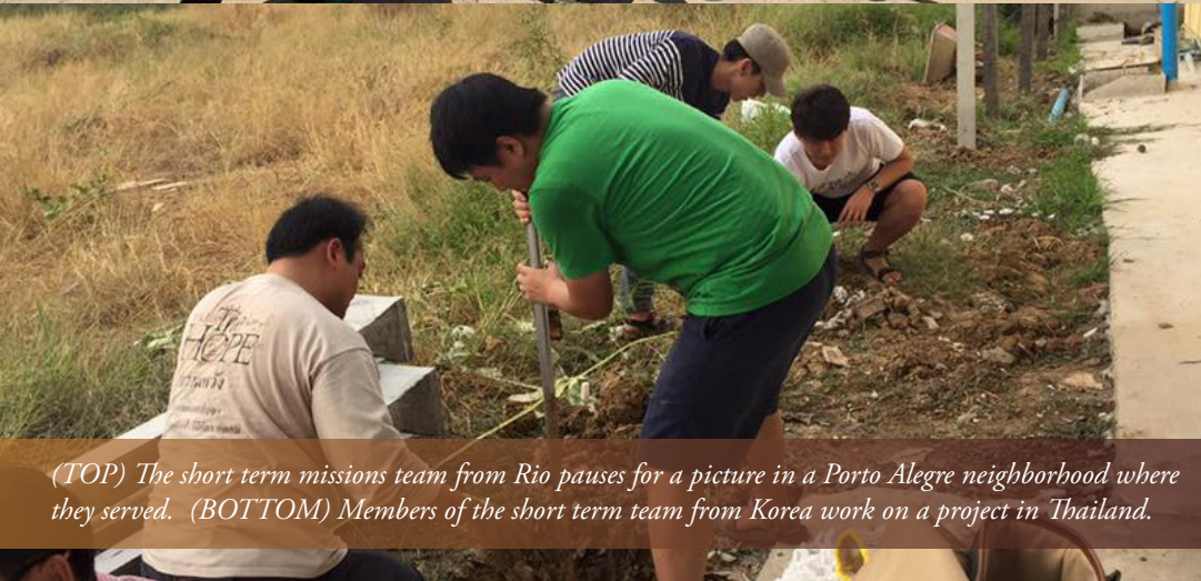
(TOP) The short term missions team from Rio pauses for a picture in a Porto Alegre neighborhood where they served. (BOTTOM) Members of the short term team from Korea work on a project in Thailand.