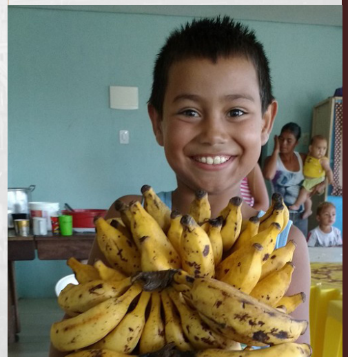
This child is glad to be part of the feeding ministry at our church plant in Capão that is benefiting from partnership with the town's government.