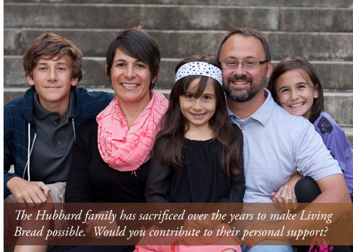
The Hubbard family has sacrificed over the years to make Living Bread possible. Would you contribute to their personal support?

We need to raise $500 per month, or $6,000 per year , to help all our church planters in Brazil ($500 total, not per church planter). Will you make a single or monthly gift to help bless these families who humbly serve in very hard places?