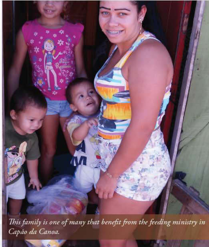
This family is one of many that benefit from the feeding ministry in Capão da Canoa.